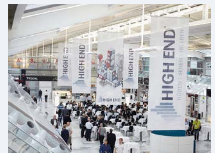
Atrium MOC > picture download