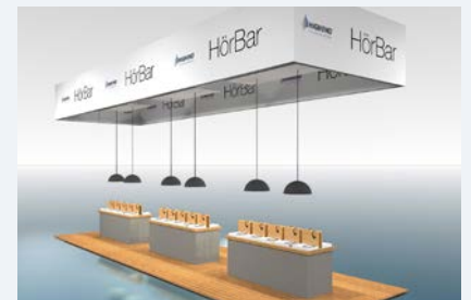
Headphone corner > picture download