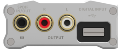
Audio Outputs (to high-end audio system) Intelligent SPDIF® Input/Output USB type A "OTG" socket (with iPurifier technology)