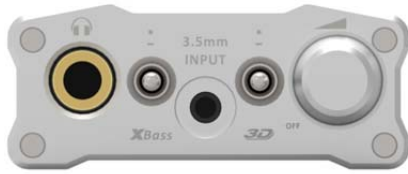
6.3mm headphone output 3D Holographic for Headphones® AND Speakers® 3.5mm analogue line input Direct/Active pre-amp with analogue volume control