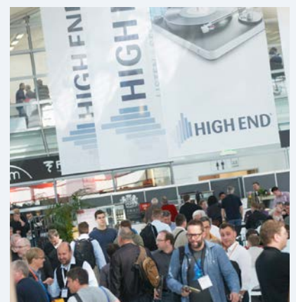
Audience at the Atrium