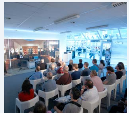
Musical demonstration > picture download