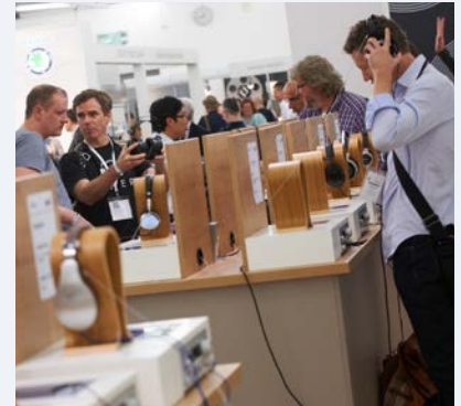
Headphone corner > picture download

The visitor numbers do NOT include the journalists (516) and do NOT include the 2,945 exhibitor badges issued (2,945).