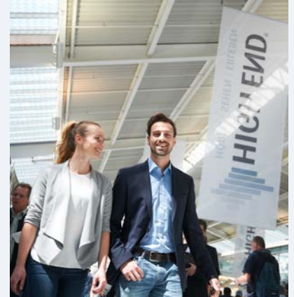
Welcome to the HIGH END 2016 > picture download

“The HIGH END plays a decisive role for the audio industry. Making the advantages of high-quality music playback accessible to a broad public remains important. The HIGH END has done an outstanding job in this process. Over the last few years in particular, the international presence at the trade fair has been increasing, which is good for the entire industry. I hope that this trend continues and more and more people continue to realise that the cultural value of music can only be experienced by means of perfect audio reproduction with technically sophisticated products.”