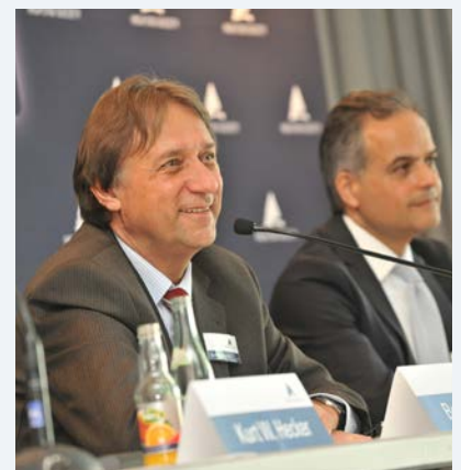
Press conference > picture download